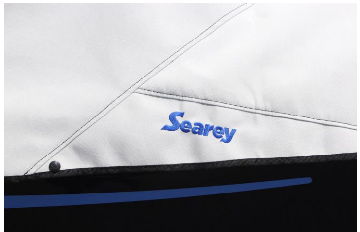
"Sunbrella" tough and smooth

The light-weight, non-woven, water resistant, synthetic, "breathable" material sheds moisture and has a UV-blocker treatment. The covers fold small and light for away trips. Used on normally-hangared aircraft, the fabric life expectancy should be many years ..