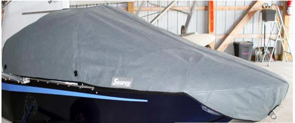
Dark Grey Canopy Cover

CLA Deluxe covers have the longest life expectancy against UV but their extra bulk and weight make them less desirable for away flights. Therefore, Deluxe covers are the choice for aircraft stored outdoors . Despite their UV treatments, the sun's UV will eventually damage all covers. Therefore, no warranty on fabric life is stated or implied.