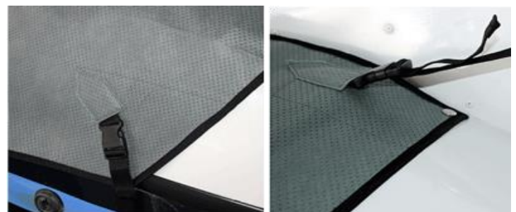
Bow-eye & Fasteners

All CLA Canopy Covers are "fitted" and finished with soft, black bias binding. This also reinforces bow-eye openings. There are three adjustable quick-connect straps whose fasteners are positioned above the fabric lip in order to protect the gelcoat. Aft corners have female dome pop-fasteners. Matching male screw fasteners are supplied with the cover for attaching to the turtle deck and rub strip. When used inside a hangar only the aft strap or dome fasteners are required to keep the cover in place.